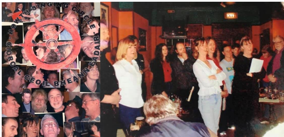
An early edition of The Sweet Nightingale – how many can you identify? Answers at the end of this newsletter